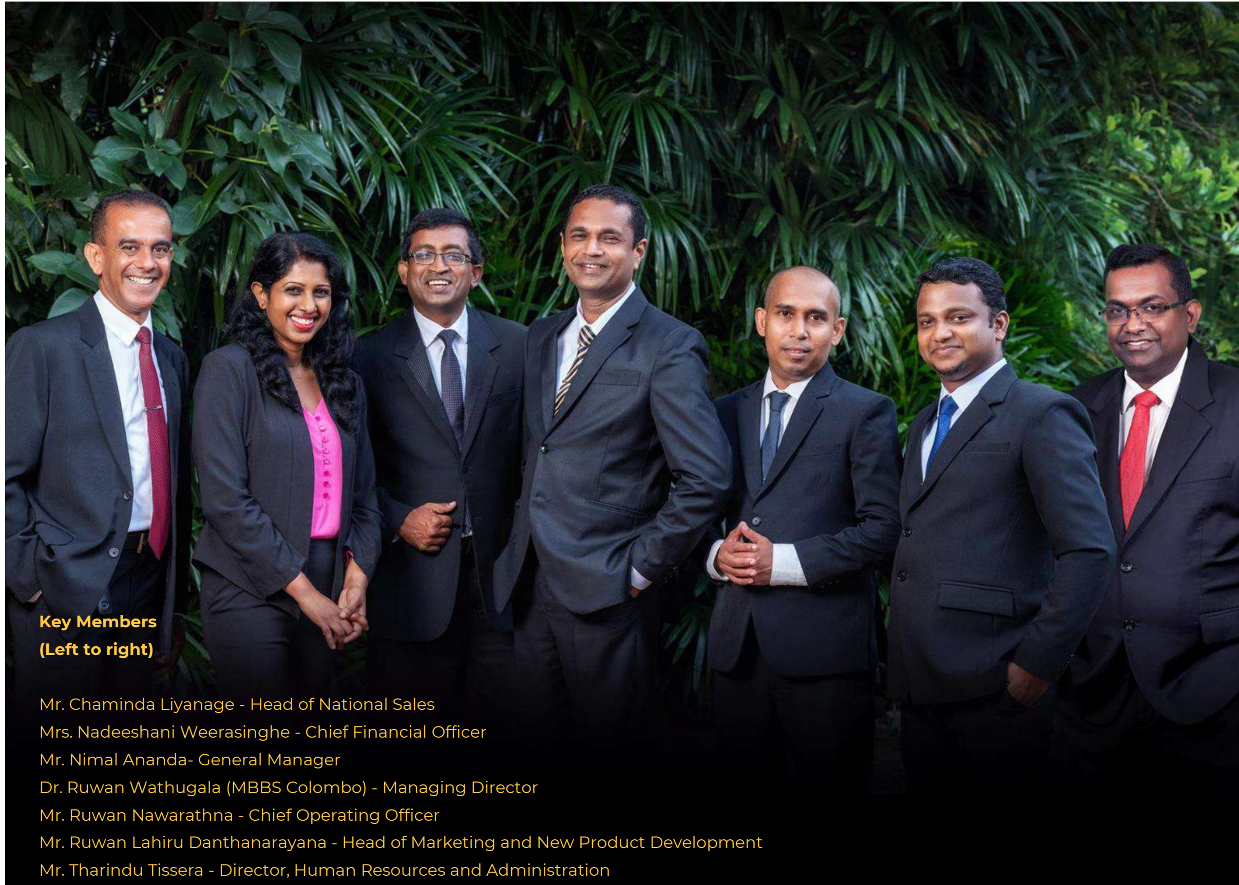
Key Members (Left to right)