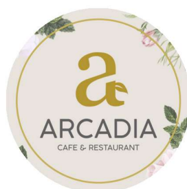
Arcadia Cafe and Resturant