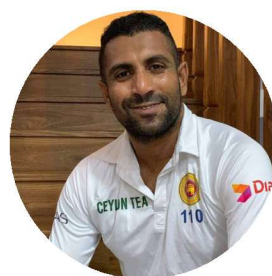
DP 30 by Dhammika Prasad