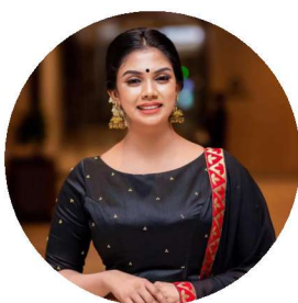
Damithri Dance Academy