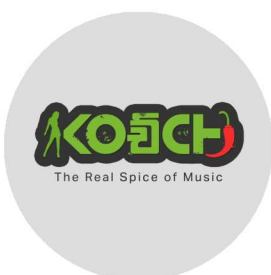
Kochchi Music Band